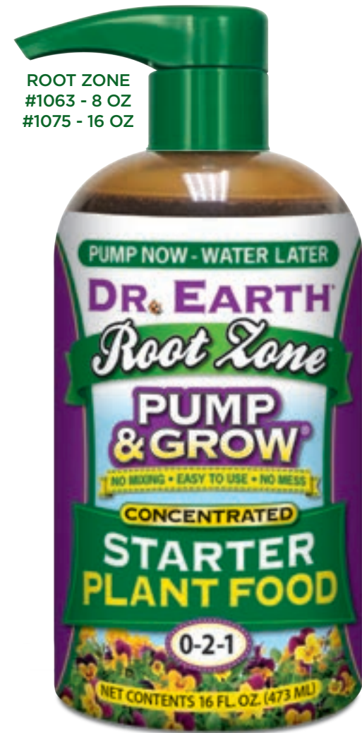
ROOT ZONE #1063 - 8 OZ #1075 - 16 OZ