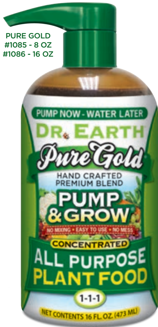
PURE GOLD #1085 - 8 OZ #1086 - 16 OZ