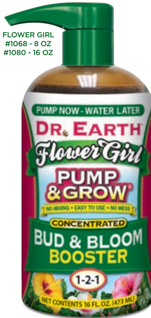
FLOWER GIRL #1068 - 8 OZ #1080 - 16 OZ